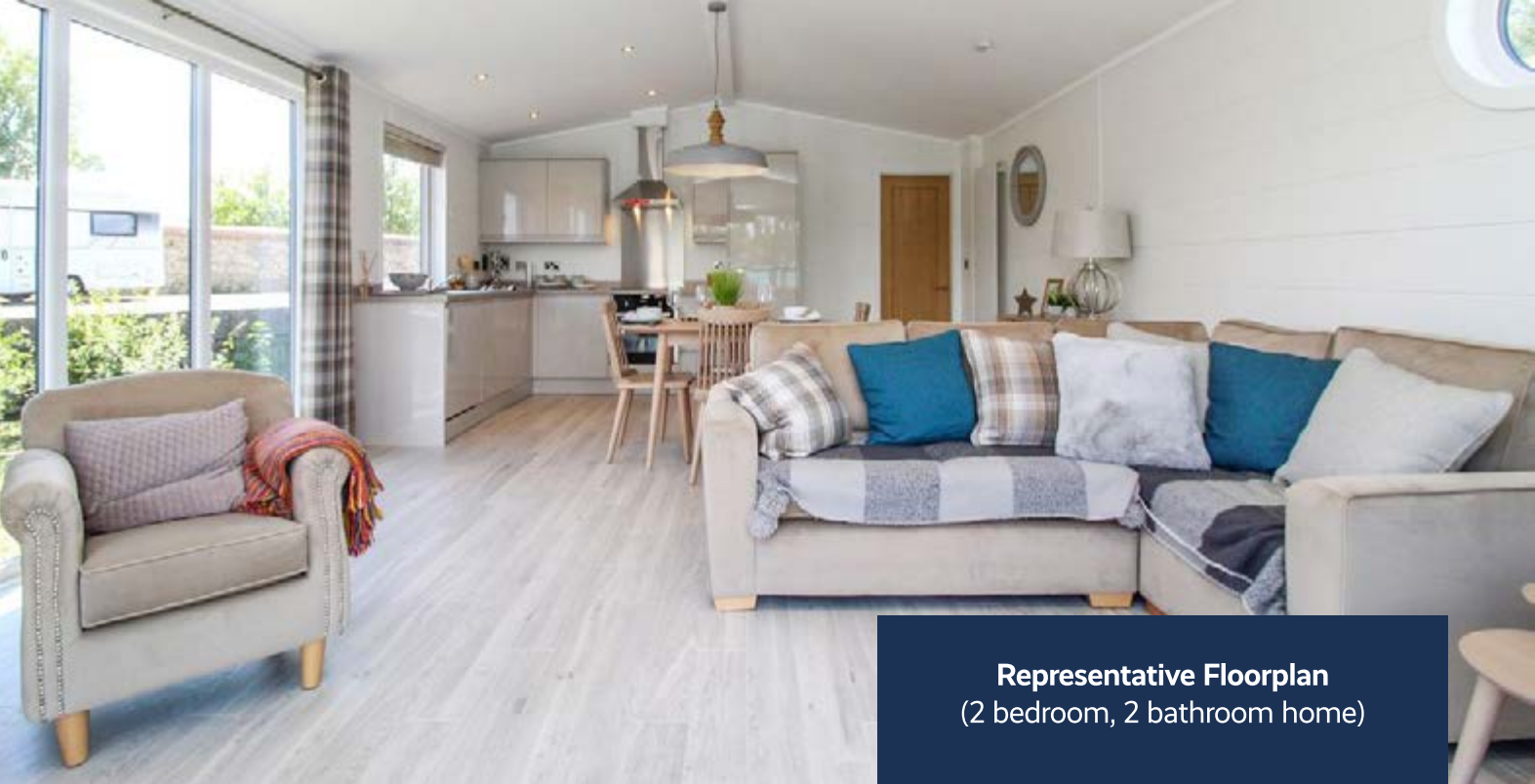
Representative Floorplan (2 bedroom, 2 bathroom home)